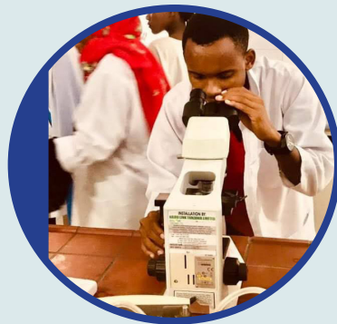
An SLS graduate, now studying medicine.

Where children know they are loved, love to learn and learn to serve.