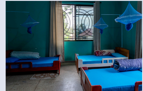
New Student Homes